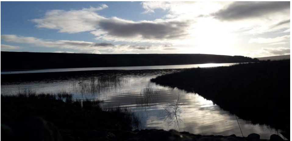
Sun setting on Grimworth Reservoir between Grassington and Pately Bridge. A beautiful winter walk, so much wildlife about.

Thinking and intending and doing, though, is like a flame that sheds its light and warmth all around, or like seed sown in the soil, that grows into a tree or a flower and becomes something. (Heaven and Hell paragraph 475)