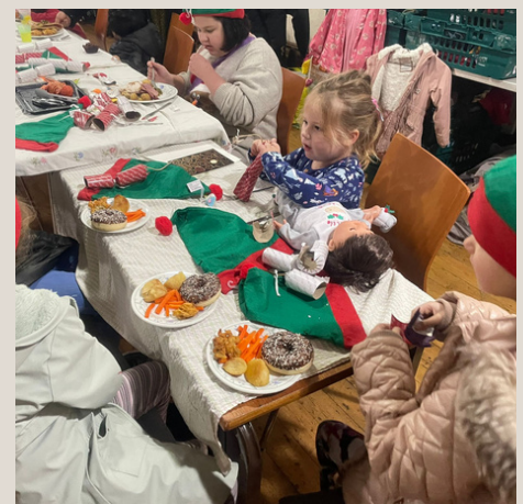
Christmas Day at Bradford enjoying a meal together