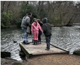
Picnic, park and walk at St Ives Bingley with families